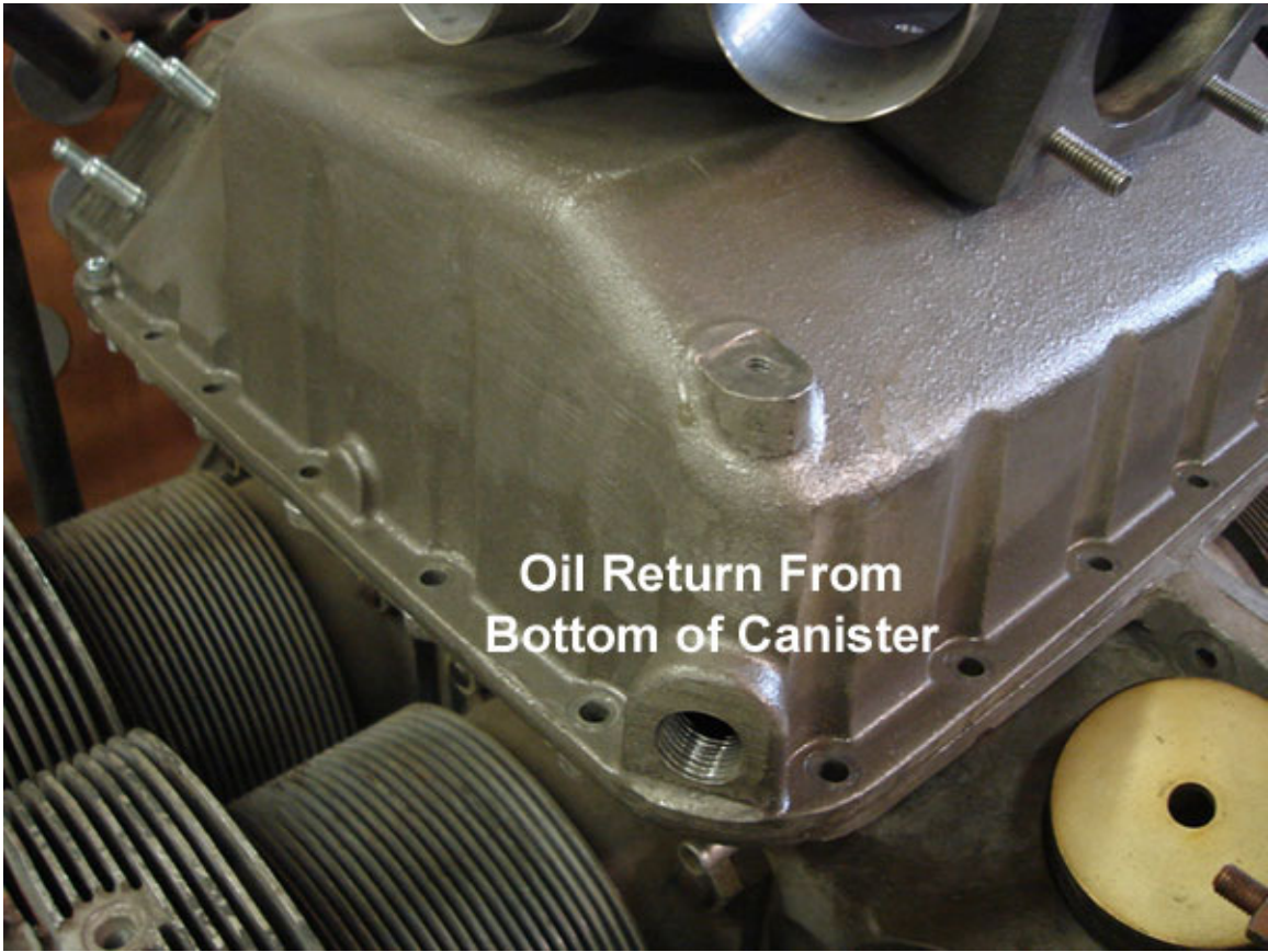
Oil Return From Bottom of Canister